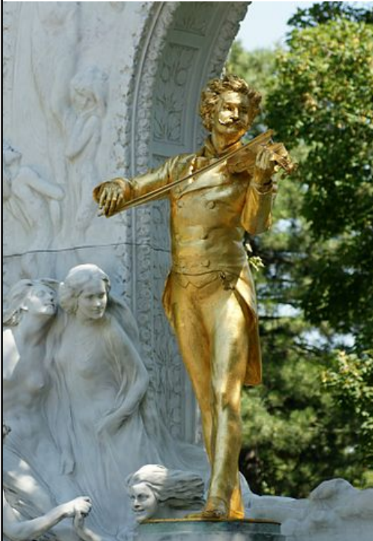
Johan Strauss in Stadtpark, Vienna