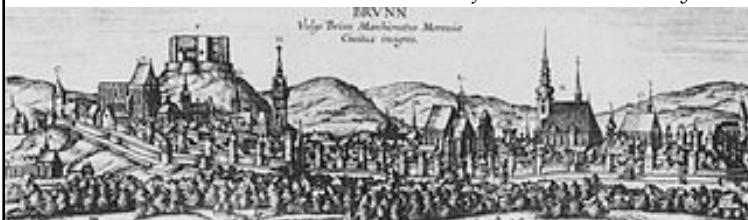
Woodcut of Brno in 16th century

Our visits to Berlin and Vienna need no special advocacy. Consistently over the years I have found these two cities to be the leading centres of fine Western music making with their many superb orchestras, (no fewer than eight in Berlin), the finest opera companies in Europe and their incredibly devoted and knowledgeable audiences. Every visit to these fabulous cities gives me a special thrill.