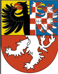
Coat of arms, Slavkov Castle

The 15 night tour starts in Krakow on 20 November in Krakow and finishes in Berlin on 5 December. At this point, only our program for the Janacek Festival in Brno is confirmed and booked. I will advise the full program and itinerary in April once the various concert halls and opera companies announce their 2018/19 seasons