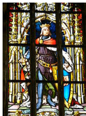
Rudolf I of Hapsburg - St Jerome's Olomeuc