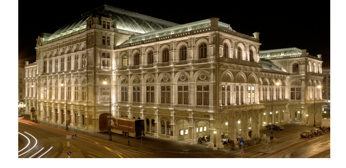
Vienna State Opera